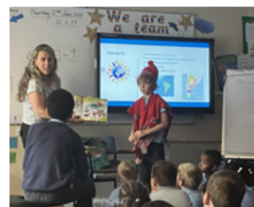
A parents and their children telling us all about Argentina.