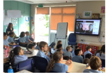
Two parents who taught us about Bulgaria and organised a video call to a Bulgarian school!

Throughout the week, we were fortunate to have many parents generously volunteer their time to speak to multiple classes about their cultures and traditions.