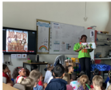
A parent who came to read a Nigerian story book to year 2.

I liked learning about the culture in Pakistan. -Pupil