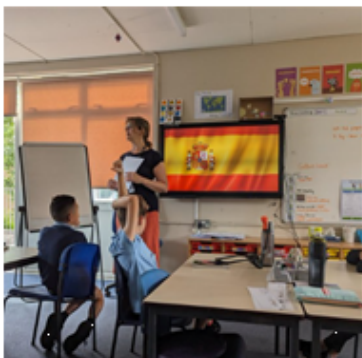
An amazing Spanish lesson in year 5!