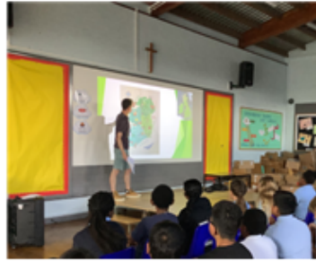
A volunteer teaching us about his Irish culture.

It was a pleasure to participate! -Parent